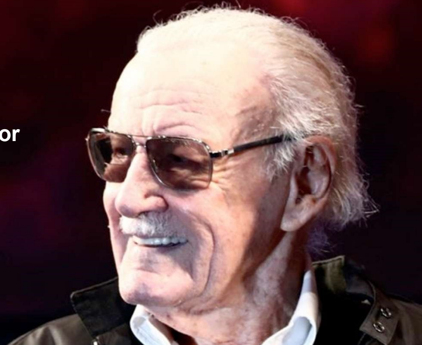
STAN LEE Producer and Co-creator

“Marvel has always been and always will be a reflection of the world right outside our window”