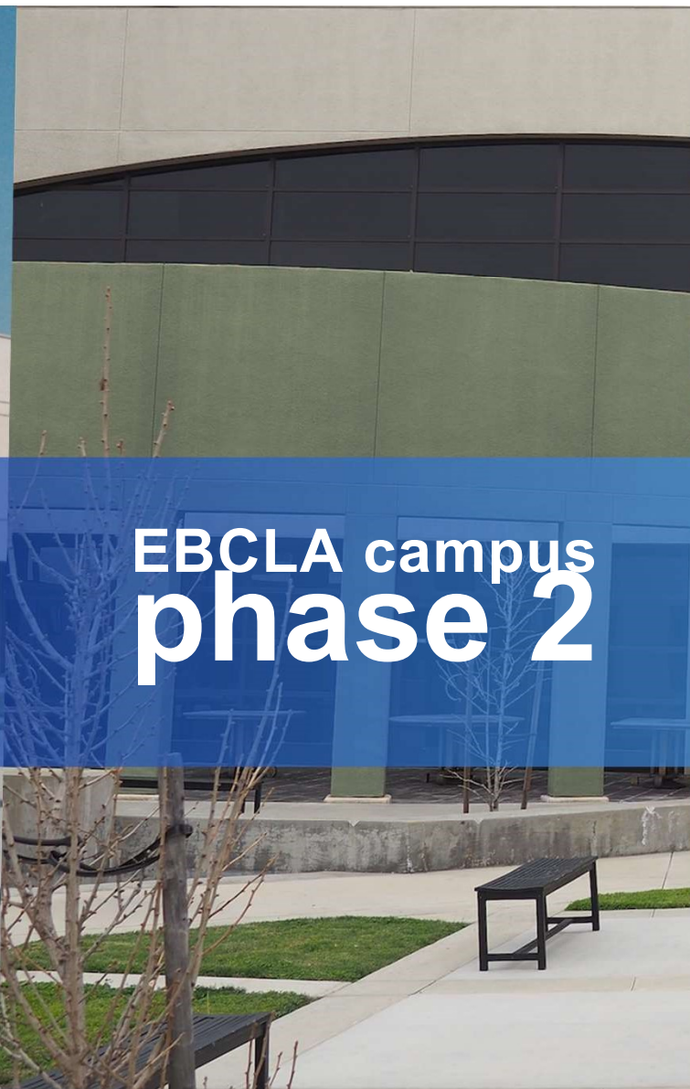
EBCLA campus phase 2