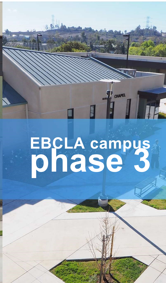
EBCLA campus phase 3