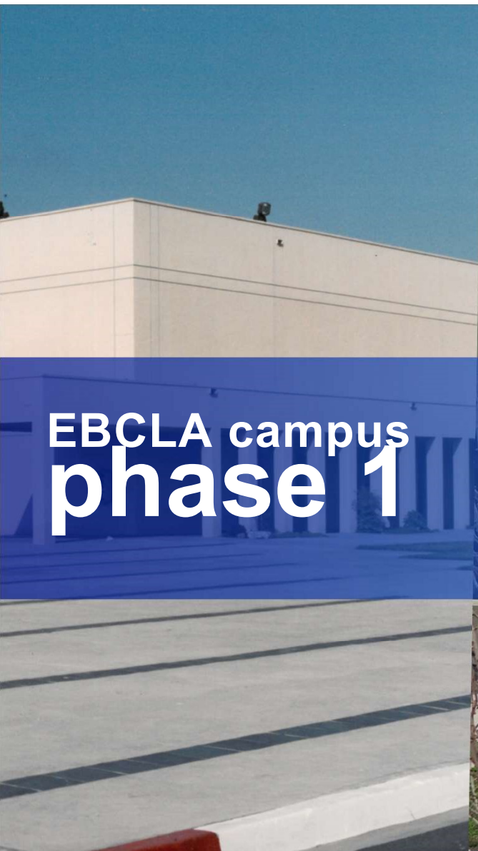
EBCLA campus phase 1