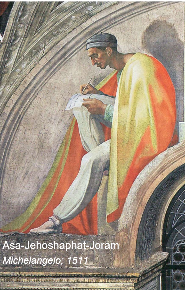
Asa-Jehoshaphat-Joram Michelangelo; 1511

5 Jehoshaphat stood in the assembly of Judah and Jerusalem, in the house of the Lord, before the new court, 6 and said, “O Lord, God of our ancestors, are you not God in heaven? Do you not rule over all the kingdoms of the nations? In your hand are power and might, so that no one is able to withstand you. 7 Did you not , O our God, drive out the inhabitants of this land before your people Israel, and give it forever to the descendants of your friend Abraham? 8 They have lived in it, and in it have built you a sanctuary for your name, saying, 9 ‘If disaster comes upon us, the sword, judgment, or pestilence, or famine, we will stand before this house, and before you, for your name is in this house, and cry to you in our distress, and you will hear and save.’