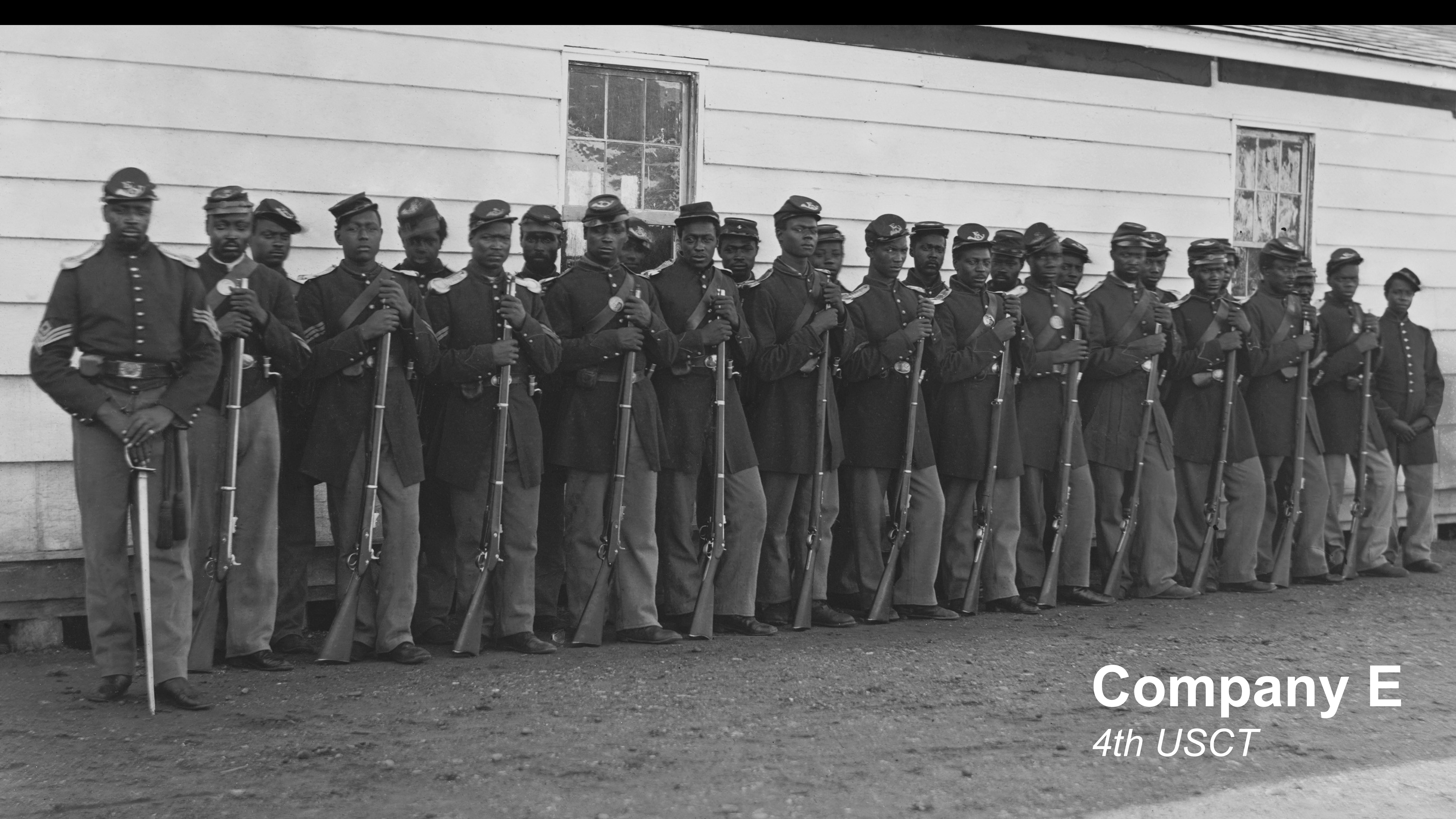
Company E 4th USCT