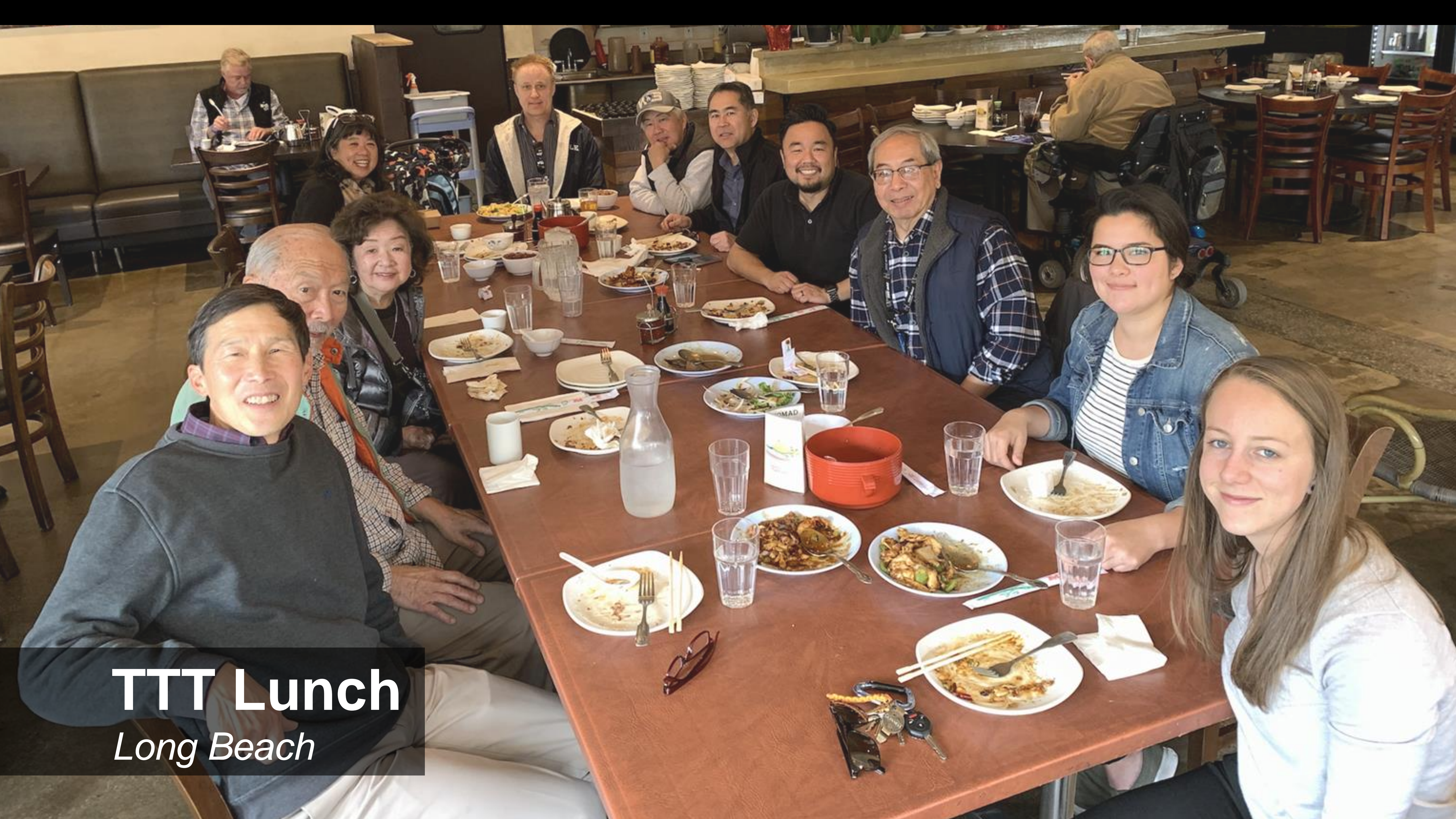
TTT Lunch Long Beach