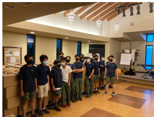
Boy Scouts with finished boxes in Chapel