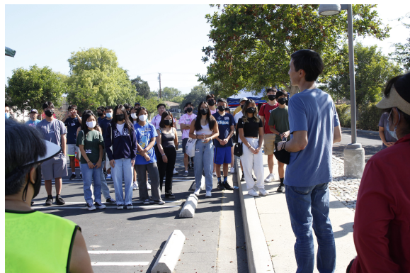
Amazing group of volunteers