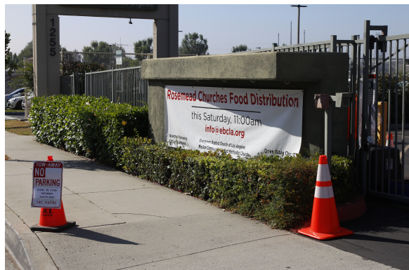
Welcome to EBCLA