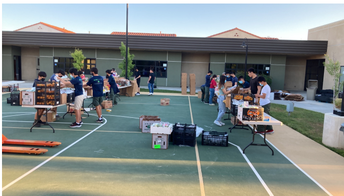
Assembling food box in Play Court