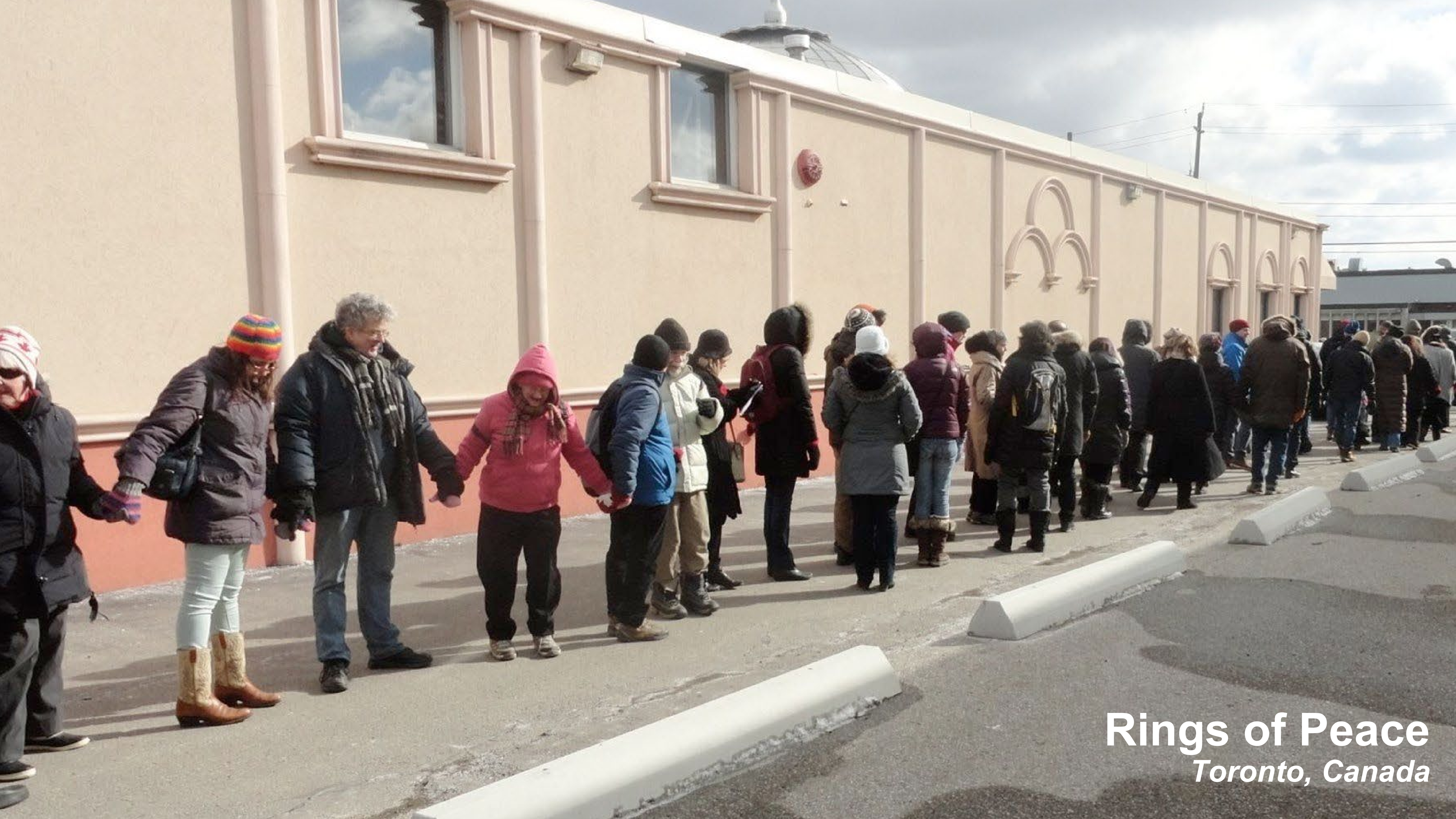
Rings of Peace Toronto, Canada