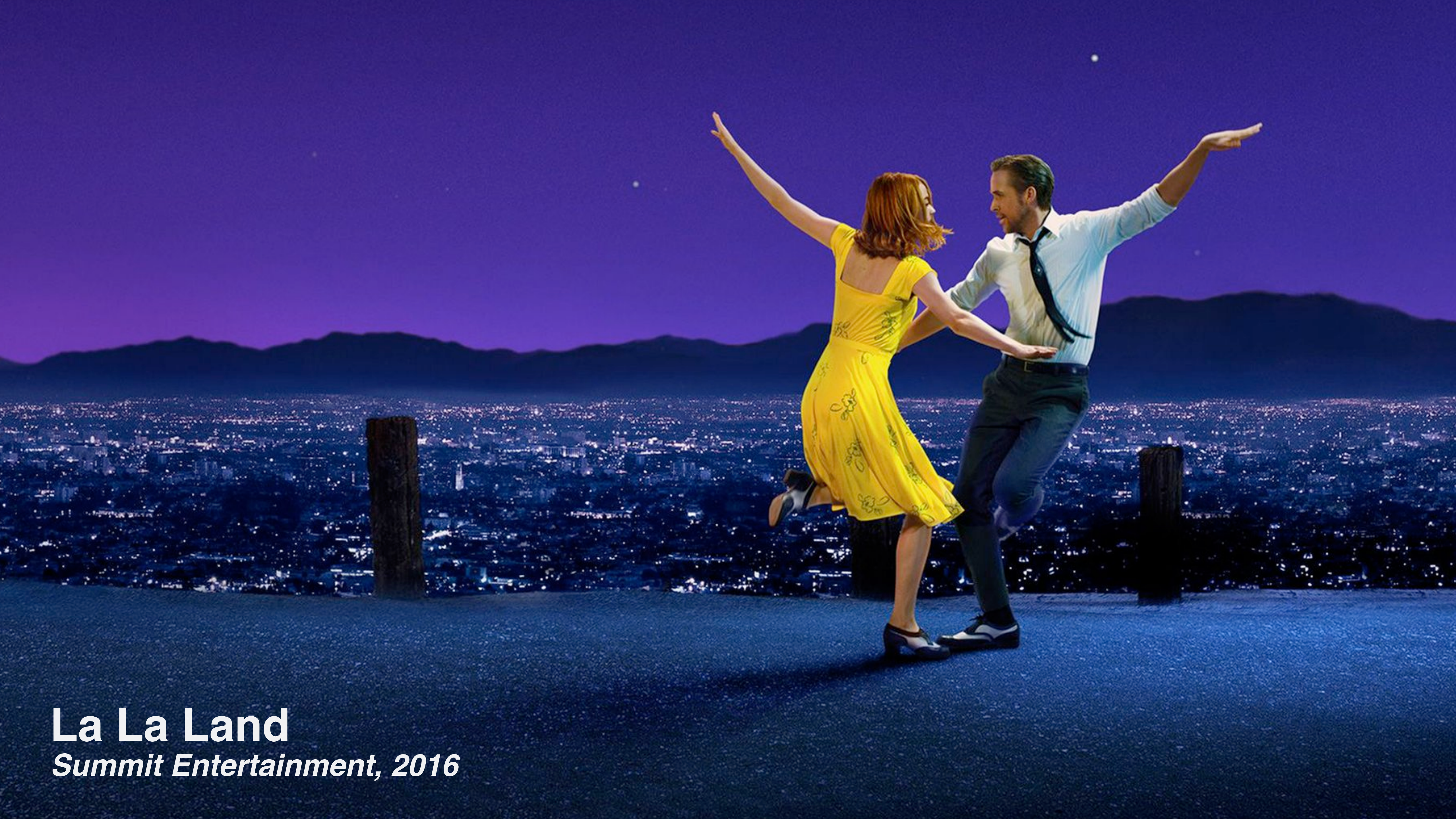
La La Land Summit Entertainment, 2016