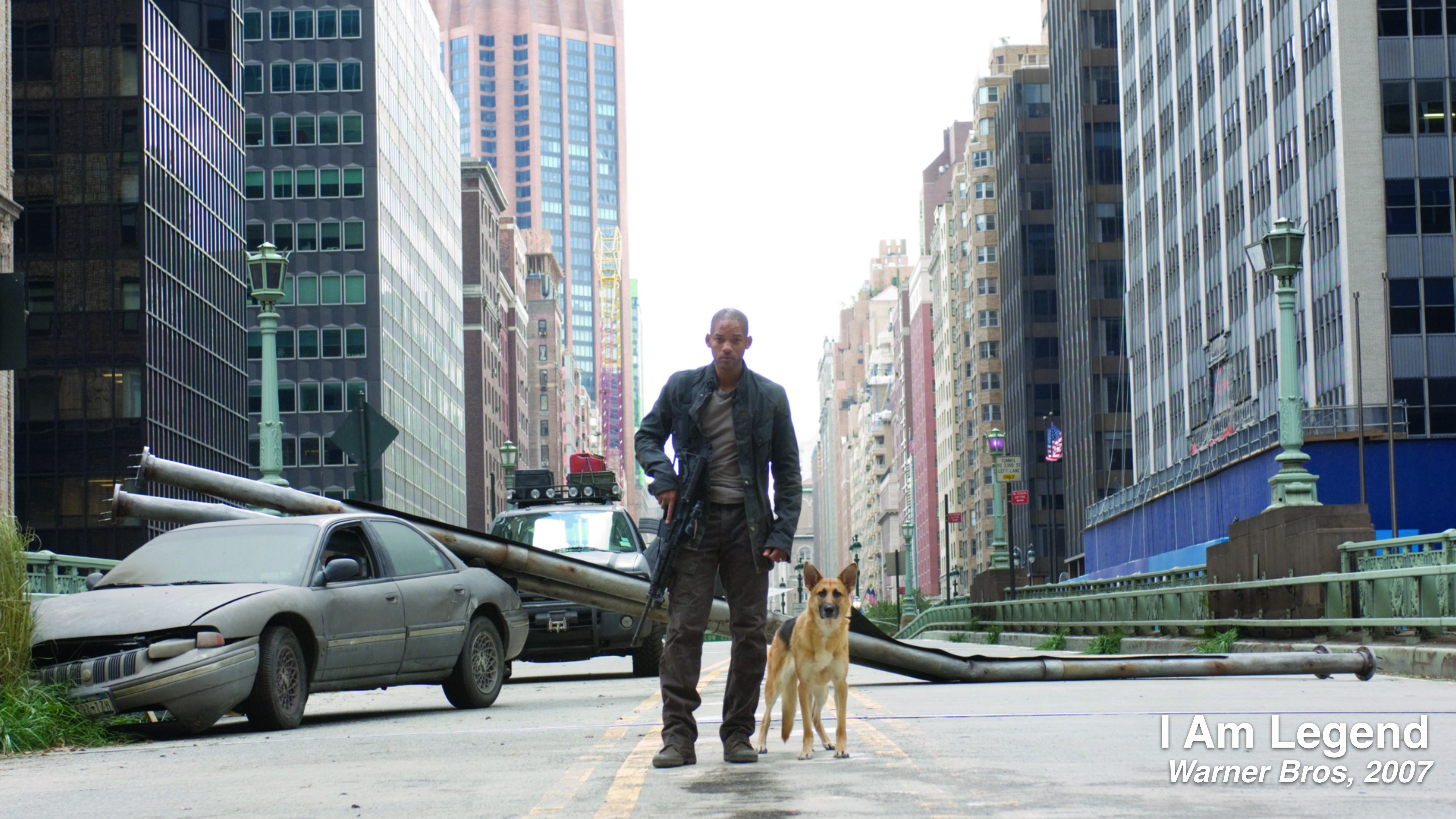
I Am Legend Warner Bros, 2007