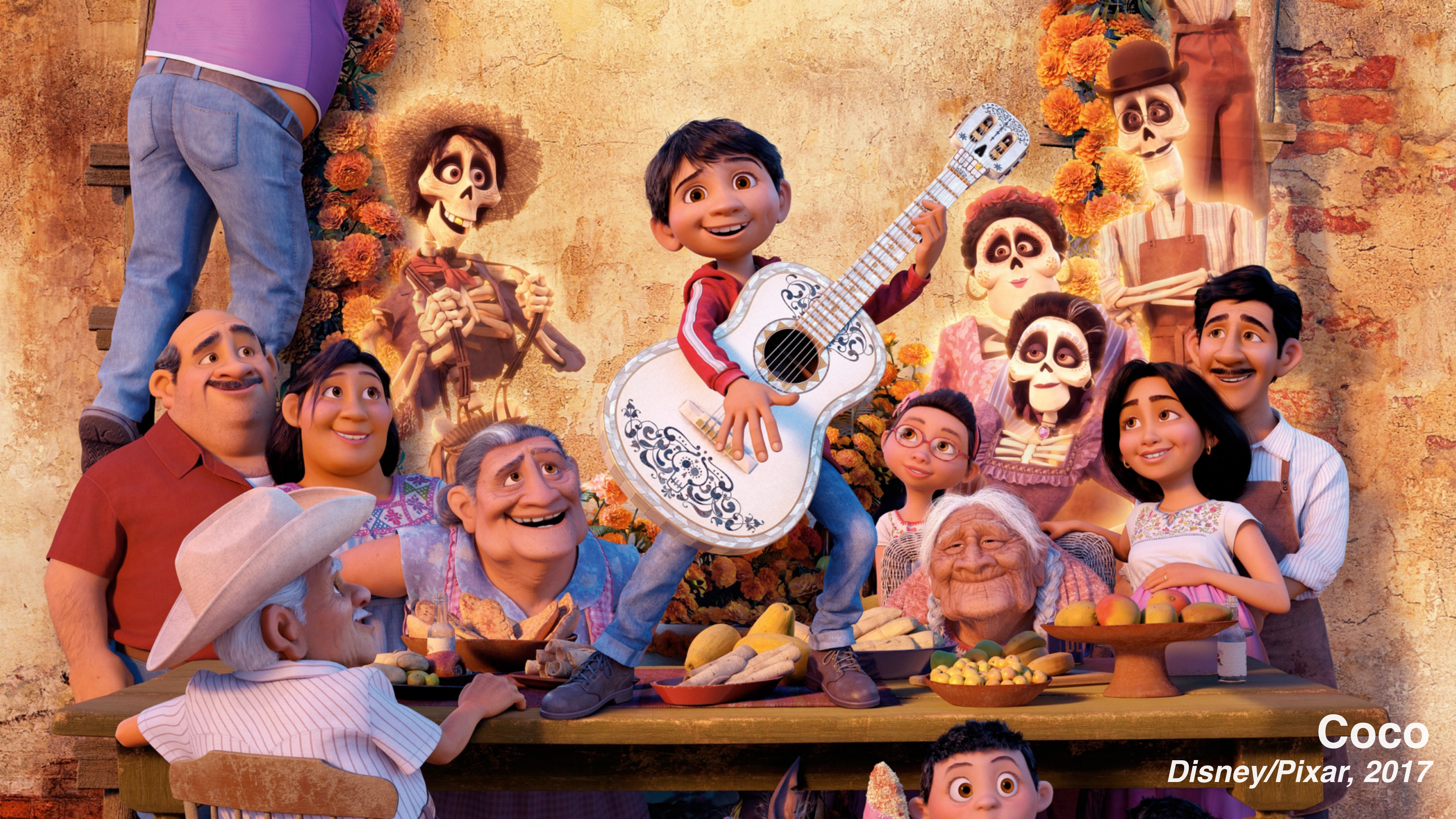
Coco Disney/Pixar, 2017