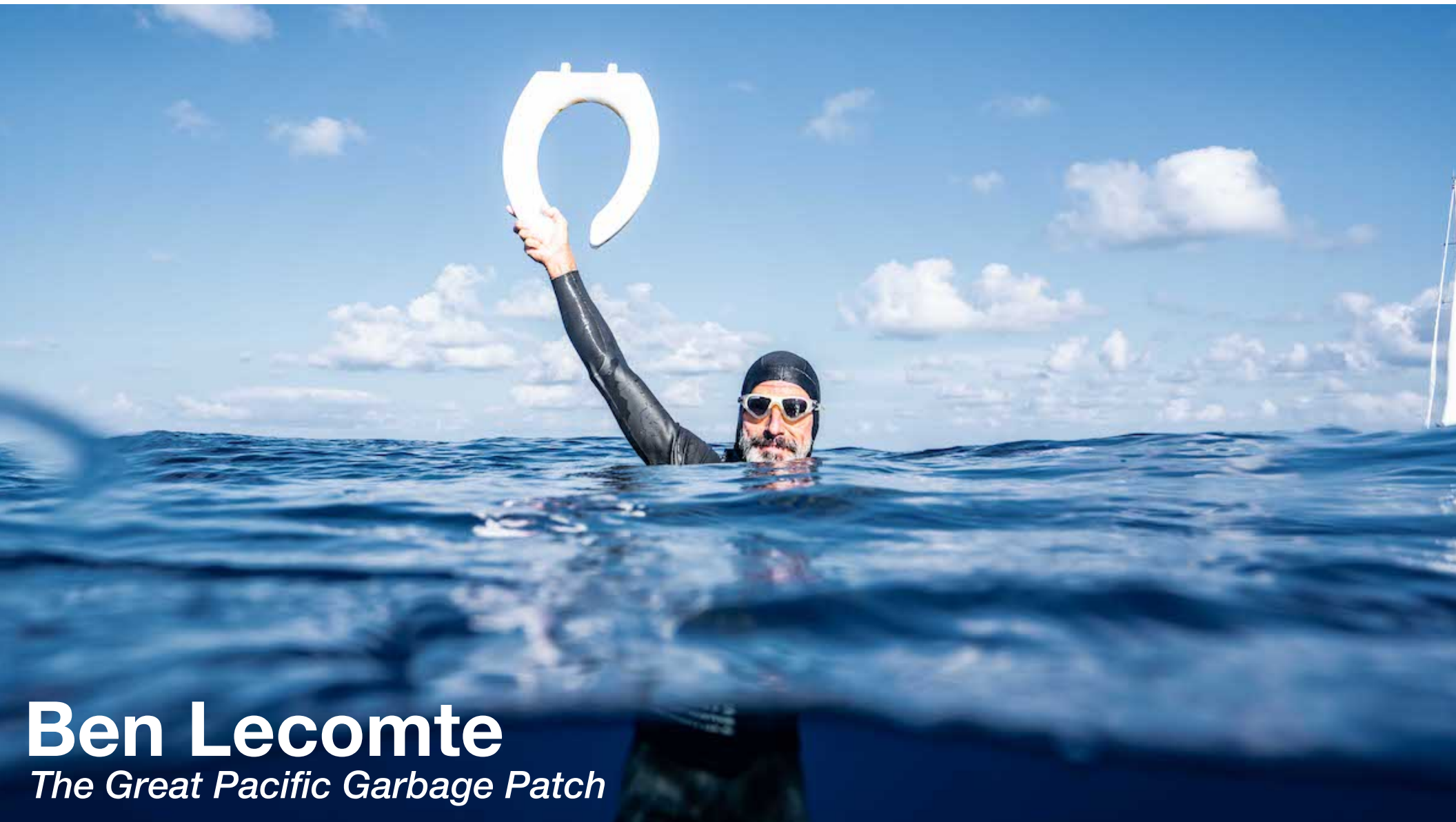
Ben Lecomte The Great Pacific Garbage Patch